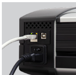
Copy to an unlimited number of printers via network or USB