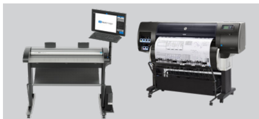
A low stand version is available for side-by-side operation