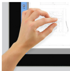
Standard Windows application or intuitive touch-screen mode